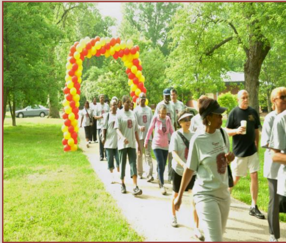
Tower Grove Park 4256 Magnolia