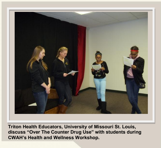
Triton Health Educators, University of Missouri St. Louis, discuss "Over The Counter Drug Use" with students during CWAH's Health and Wellness Workshop.

"Alone we can do so little; together we can do so much" Kelen Keller